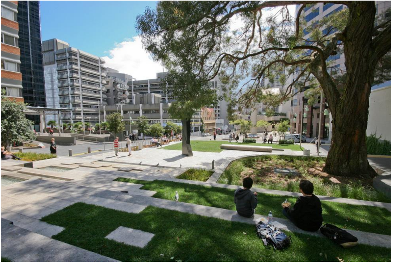
St Patrick's Square, Auckland CBD

This civic space includes a water feature celebrating the transition between Wyndham Street and Swanson Street, connecting people to their environment.