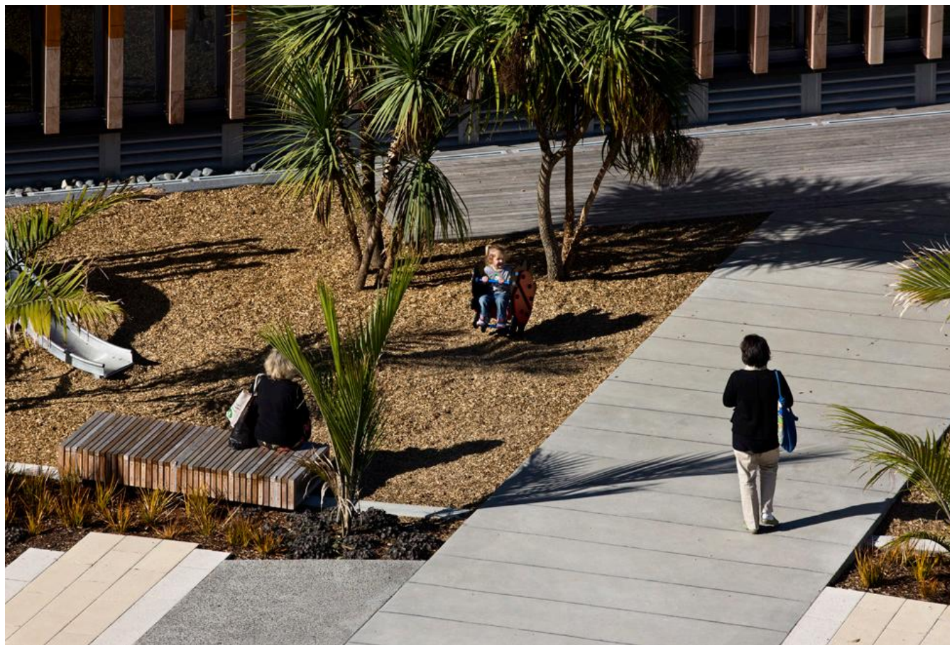
Nell Fisher Reserve, Birkenhead

Large movable loungers on the waterfront allow different sized groups to gather. These can be pushed together to accommodate a range of events.